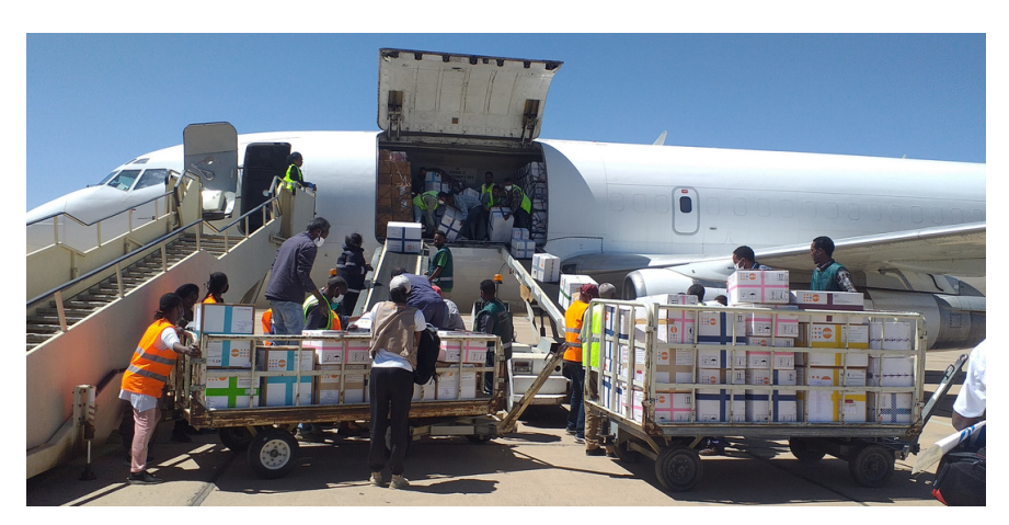
The first airlift of 5 metric tons of Sexual and Reproductive Health (SRH) Kits at its arrival at the airport of Mekelle (Tigray) to support the provision of midwifery services for more than 16,000 conflict-affected women and girls in the region.