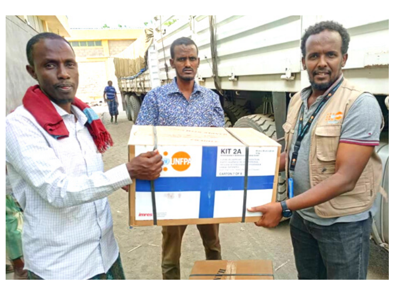
Official handover to Afar's Regional Health Bureau of Sexual & Reproductive Heath Kits worth $59,000 USD to sustain critical GBV & SRH service provision to conflict-affected women and girls in the region.