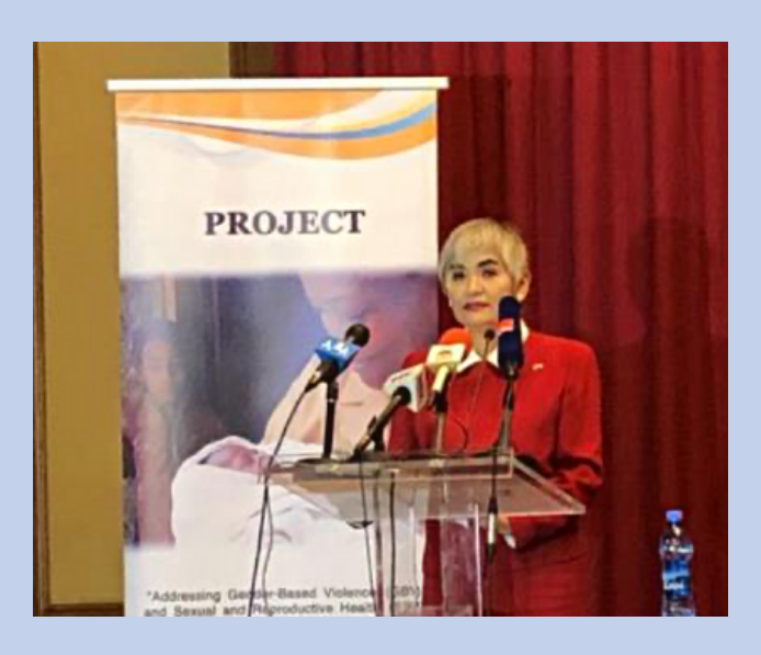
[Read the full press release]